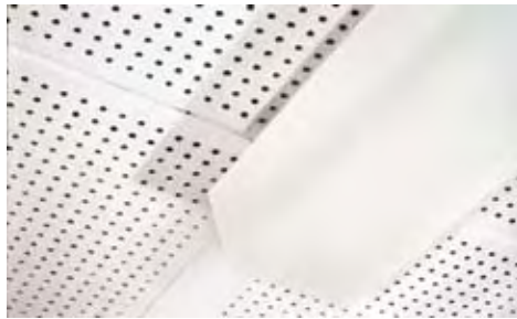
Perforated AIB ceiling tiles