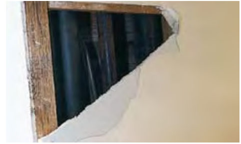
Asbestos insulating board (AIB)