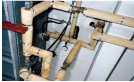
Asbestos pipe lagging