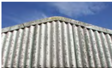
Asbestos cement wall cladding