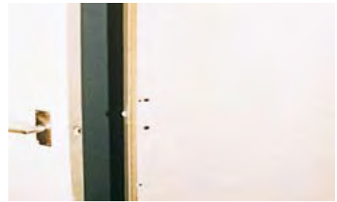
Door with AIB panel